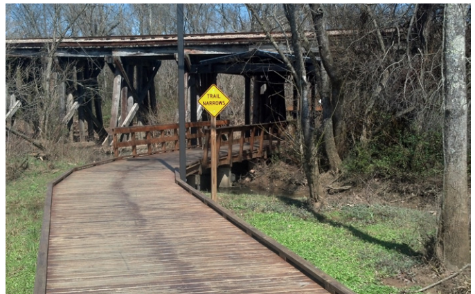
Figure 1—Existing Greenway in Alcoa, Tennessee