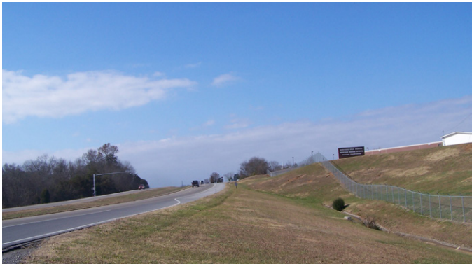
Figure 3—Heritage High School and its frontage to U.S. 321

The goals of the Maryville-to-Townsend Greenway Master Plan are as follows: