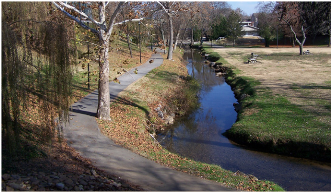
Figure 2—Existing Greenway in Maryville, Tennessee